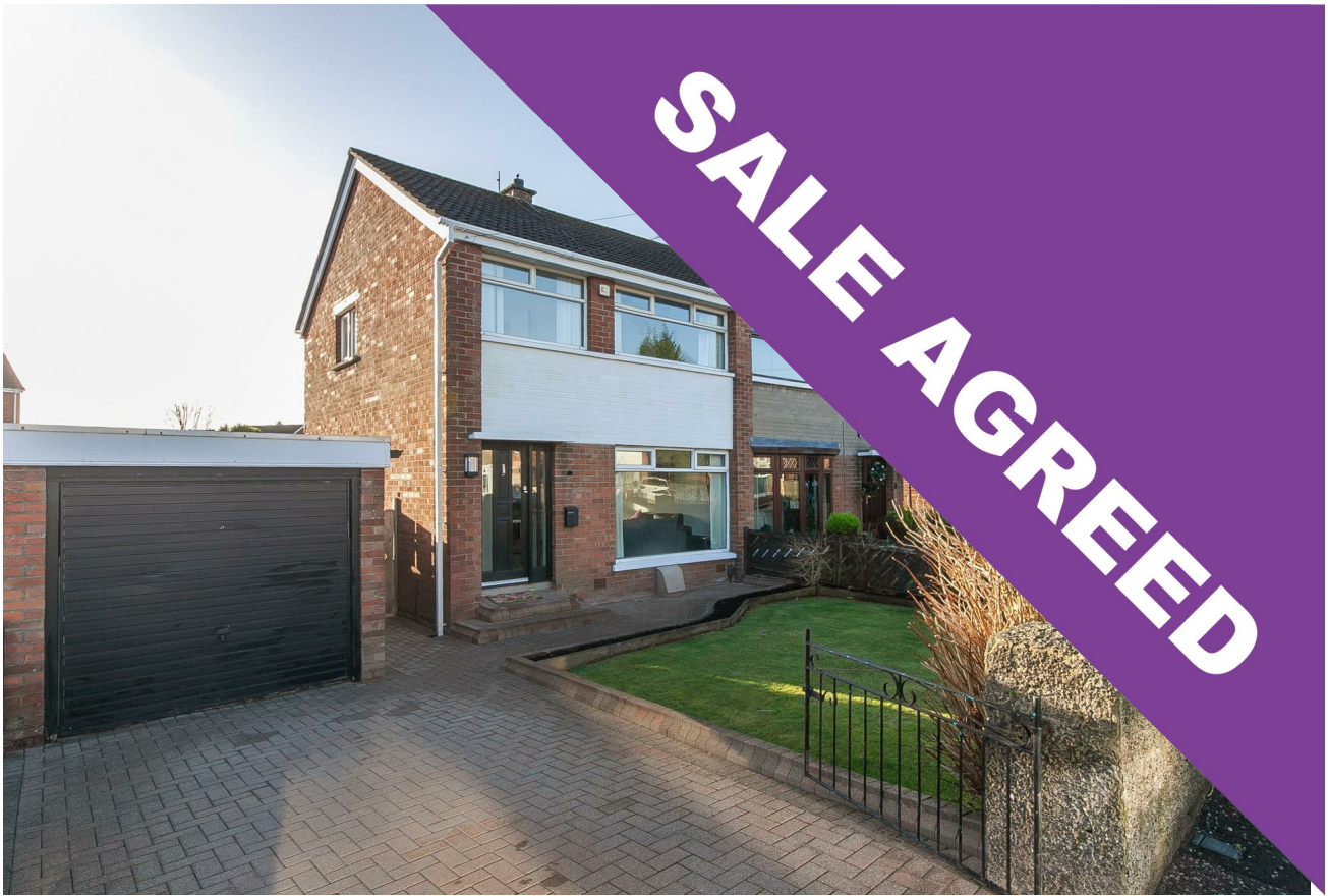
2 Richmond Way, Newtownabbey, BT36 5LQ